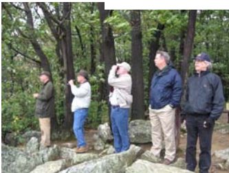
Looking for hawks at Hawk Mountain