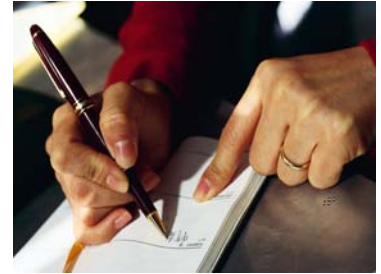
Mark your Calendars!

Chapter Social /Awards Meeting: Tuesday, June 8 Ocean View Fishing Pier Board Meeting Thursday, June 17 (As Called; TBA)