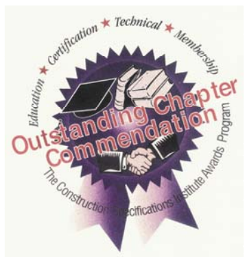
Presented to the Tidewater Virginia Chapter April 2004

***** About CSI * CSI is an individual membership technical society that serves * * as the premier integrating force for those that create and * * sustain the built environment, and as a primary gateway to * * resources for programs, services, and the exchange of * * knowledge. The Institute offers products and services that * * provide a common system of organization and presentation of * * construction information, enhancing communication among all * * construction industry disciplines. CSI's 18,000 members * * include architects, specifiers, engineers, contractors, product * * representatives, building owners, and facility managers. * * Founded in 1948, CSI is headquartered in Alexandria, Va., * * and has 143 local chapters nationwide. For more information * * about CSI, call 800-689-2900 or visit www.csinet.org. * *****